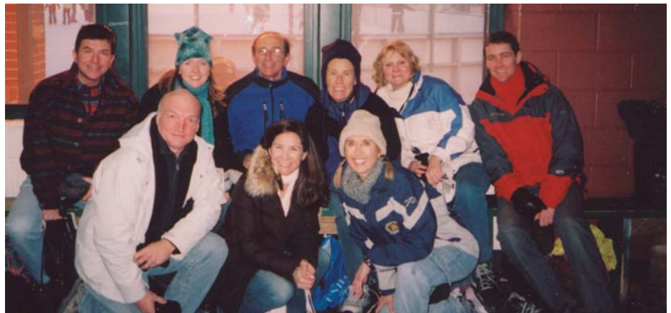
Pacers after ice skating at Warren Park.

Watch your email social updates from Heather on the upcoming ethnic dinners and summer festivals.