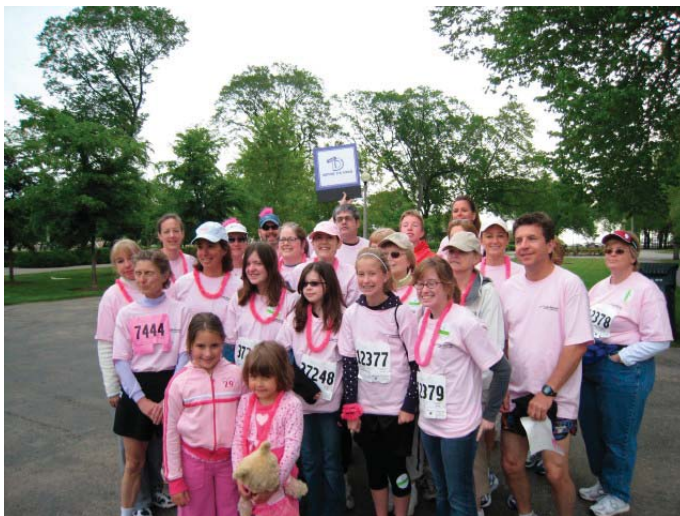
Team Triple D.