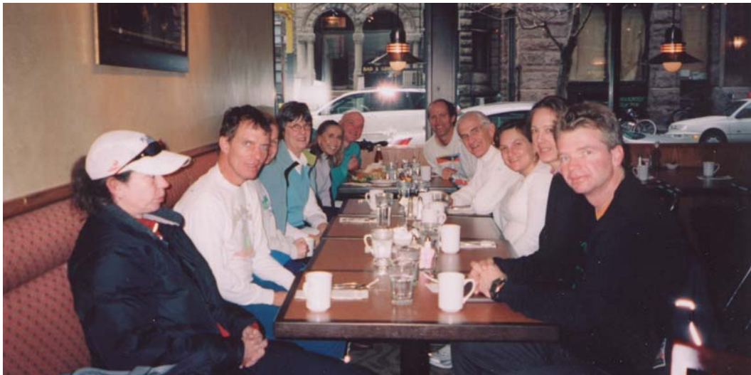
Christmas morning breakfast at the Grove.